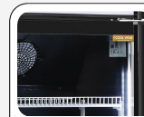
Inner assistance fan/Inner vertical LED light