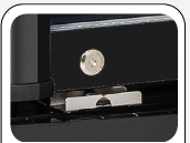
Lock fitted as standard